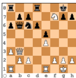
Mate in 3 for white!

Miscellaneous: Any volunteers who can help with set up: please arrive at about 1:30pm. Ask not what your tournament director can do for you. Ask what you can do for your tournament director!